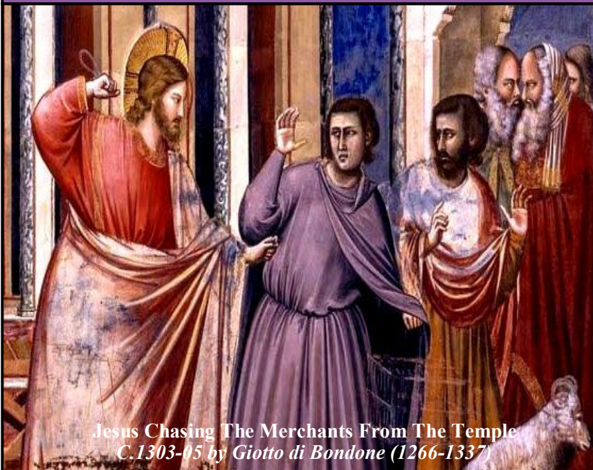
Jesus Chasing The Merchants From The Temple C.1303-05 by Giotto di Bondone (1266-1337)