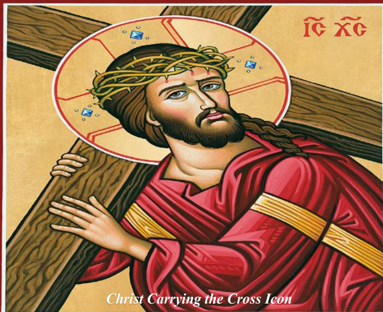
Christ Carrying the Cross Icon