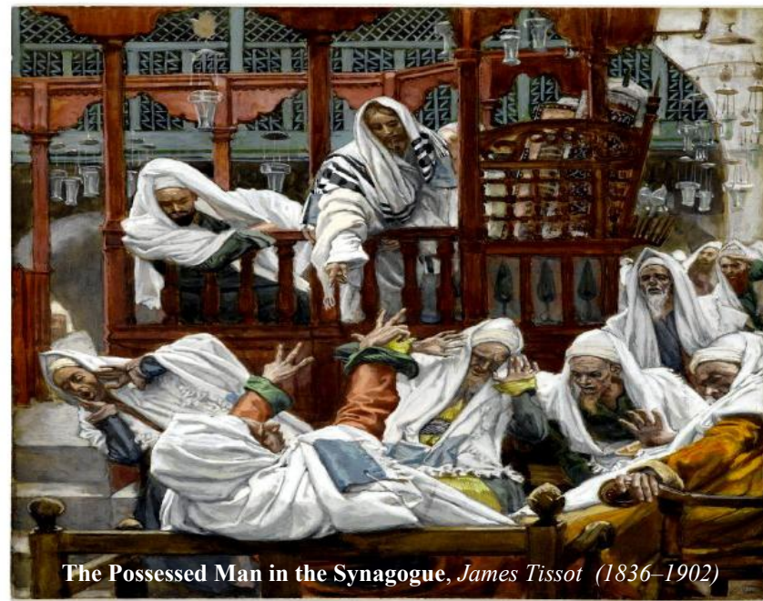
The Possessed Man in the Synagogue, James Tissot (1836-1902)