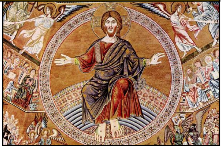
Christ in Judgment (Part of the late 13th century mosaic ceiling of the dome of the Baptistry of San Giovanni, Florence, Italy.) by Coppo di Marcovaldo (c. 1225 – c. 1276)