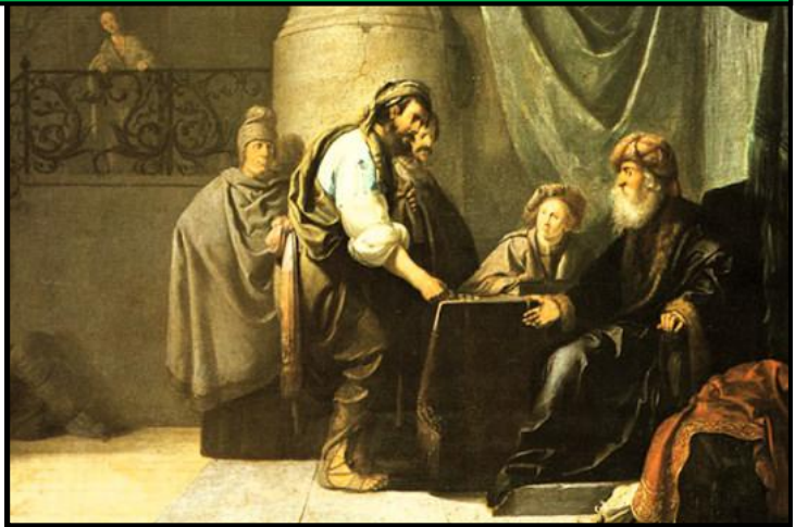
The Parable of The Talents or Minas by Willem de Poorter (1608-1668)

Email: technology@saintvincentparish.org