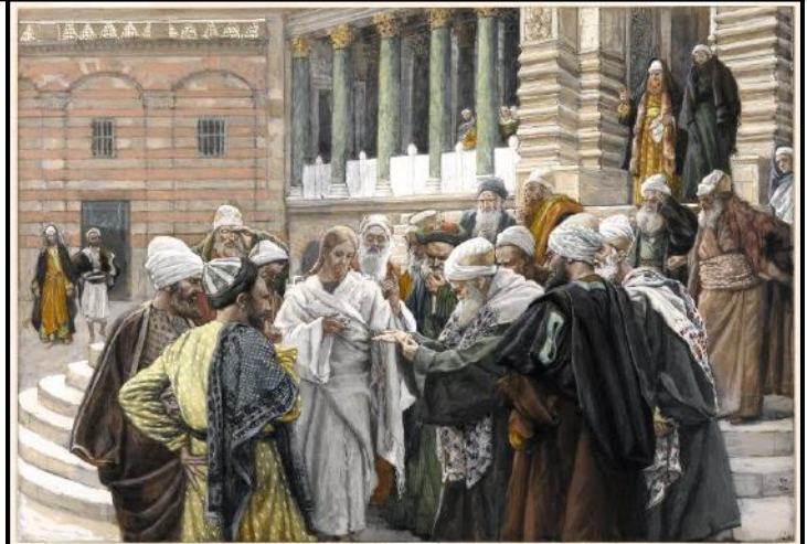
The Tribute Money - James Tissot (1836-1902)

Email: technology@saintvincentparish.org