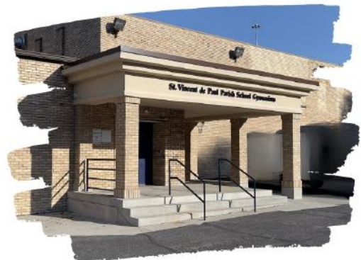
New ADA- compliant Gym Entrance leads to the remodeled hallway with new ADA-compliant restrooms.

Thank you to all the parishioners of St. Vincent de Paul. Without you and your generosity, these projects would not be possible. Thank you!