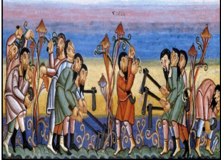
Parable of the Workers in the Vineyard from the Codex Aureus Epternacensis