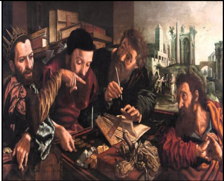
The Parable of the Unmerciful Servant Jan Sanders van Hemessen (1500-1579)

Email: technology@saintvincentparish.org