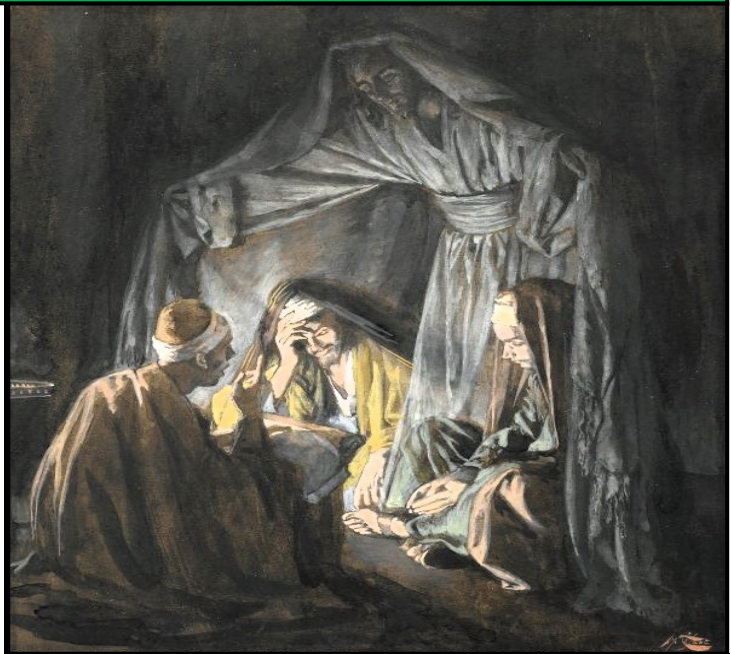
Two or Three are Gathered in my Name James Tissot (1836-1902)

Email: technology@saintvincentparish.org