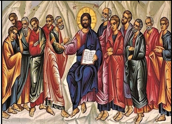
Icon: Jesus Teaching