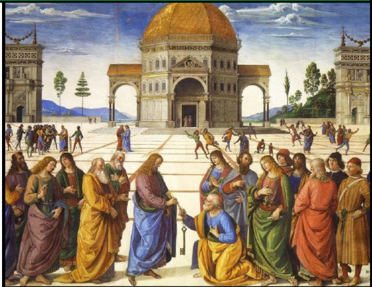
Christ gives the keys of the kingdom to Peter Pietro Perugino (1448-1523)