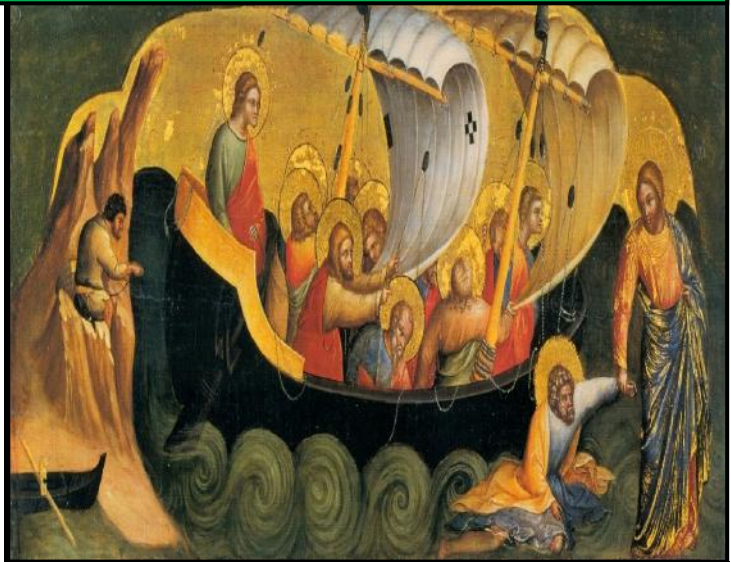
Christ Rescuing Peter from Drowning Lorenzo Veneziano (1356–1372)

* Reconciliation 1st Saturday of the Month after morning Mass