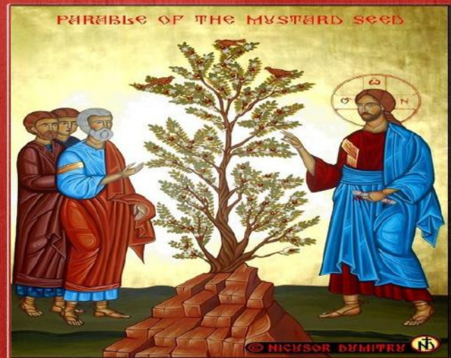
Jesus Christ, Parable of the Mustard Seed: Hand Painted Byzantine Icon

* Reconciliation 1st Saturday of the Month after morning Mass