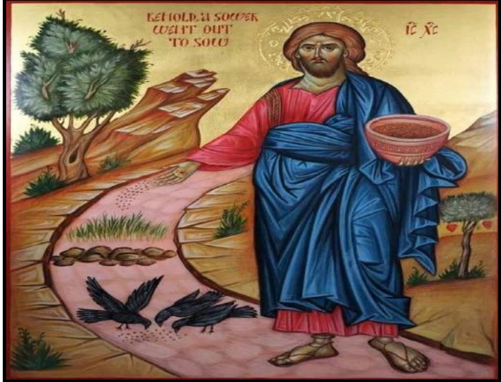
Jesus Christ, Parable of the Sower: Hand Painted Byzantine Icon

* Reconciliation 1st Saturday of the Month after morning Mass