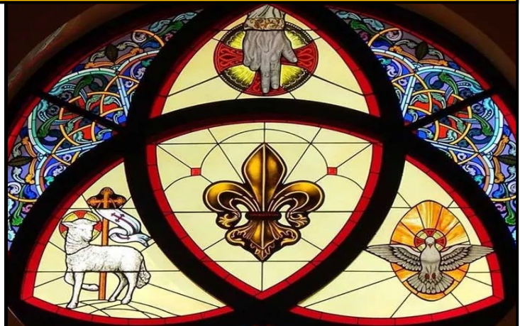
Image: Stained Glass from Most Holy Trinity Catholic Church, Covington, Louisiana

* Reconciliation 1st Saturday of the Month after morning Mass