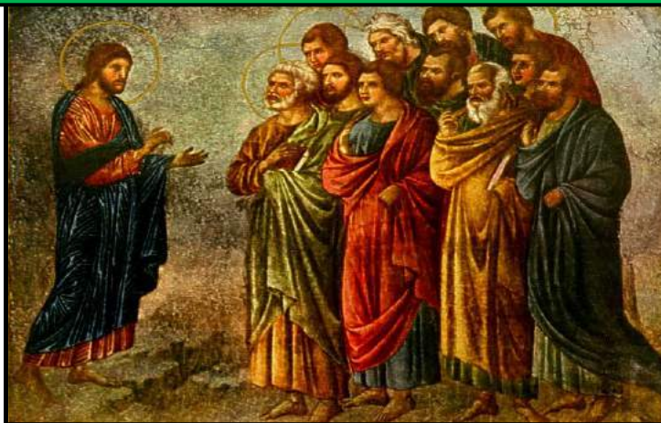
Image: Jesus Sends the Apostles Duccio di Buoninsegna, c.1300

* Reconciliation 1st Saturday of the Month after morning Mass