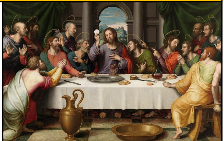
Image: Last Supper (h. 1562), The first Eucharist, depicted by Juan de Juanes, mid-late 16th century, Museo del Prado

Email: technology@saintvincentparish.org