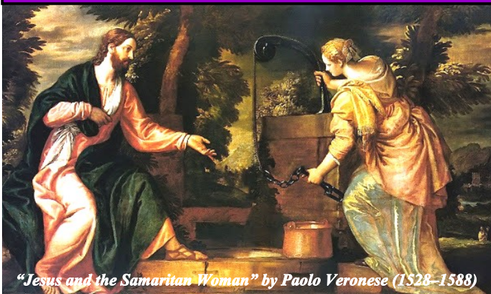
"Jesus and the Samaritan Woman" by Paolo Veronese (1528-1588)