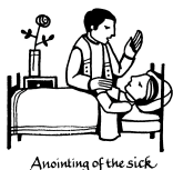
Anointing of the sick.